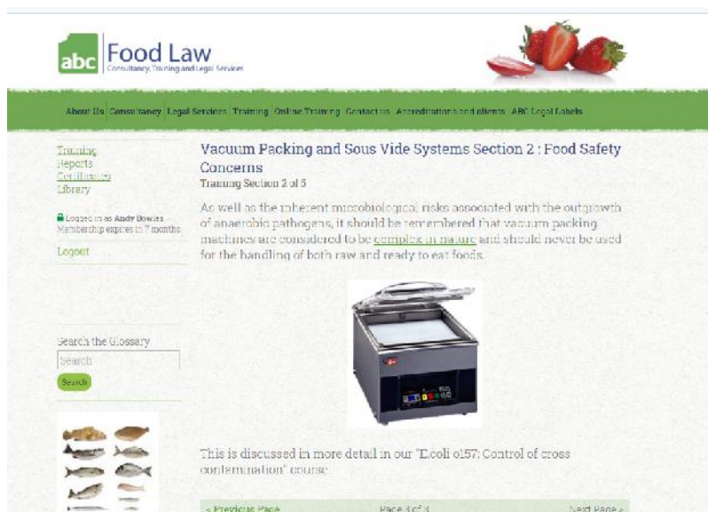
Screenshot from training pages

Objectives: To provide the user with an understanding of the key food safety hazards and appropriate controls for these techniques.